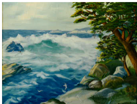
"The Beauty of the Pacific Ocean" (1953)

Throughout her ministries, she continued her favorite hobbies, including painting in oils and playing the piano.