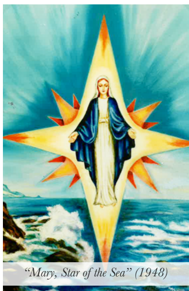
"Mary, Star of the Sea" (1948)

Throughout her ministries, she continued her favorite hobbies, including painting in oils and playing the piano.